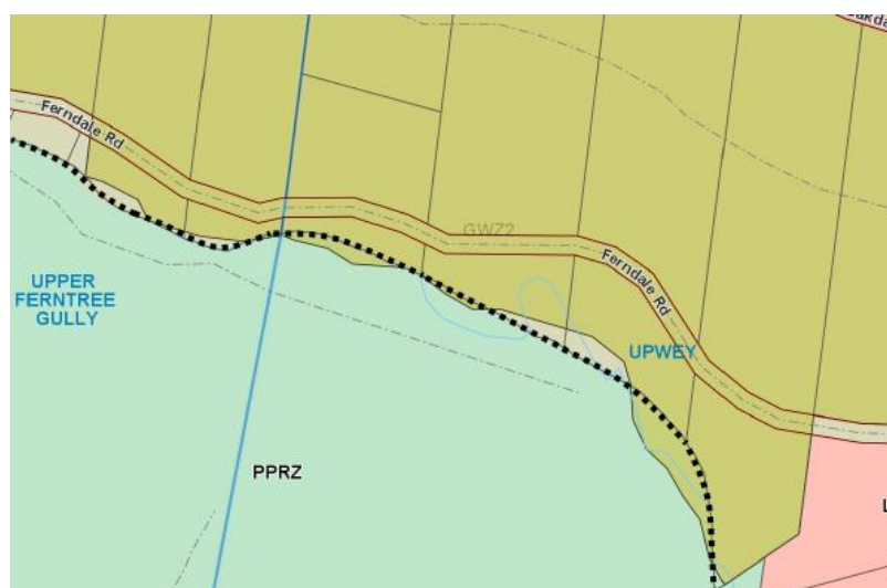
Figure 1: Boundary between private properties and PPRZ land shown by black dotted line, Restructure Overlay area shown by olive green colour.

It is proposed to correct the inaccuracies by mapping the Restructure Overlay in alignment with title boundaries.