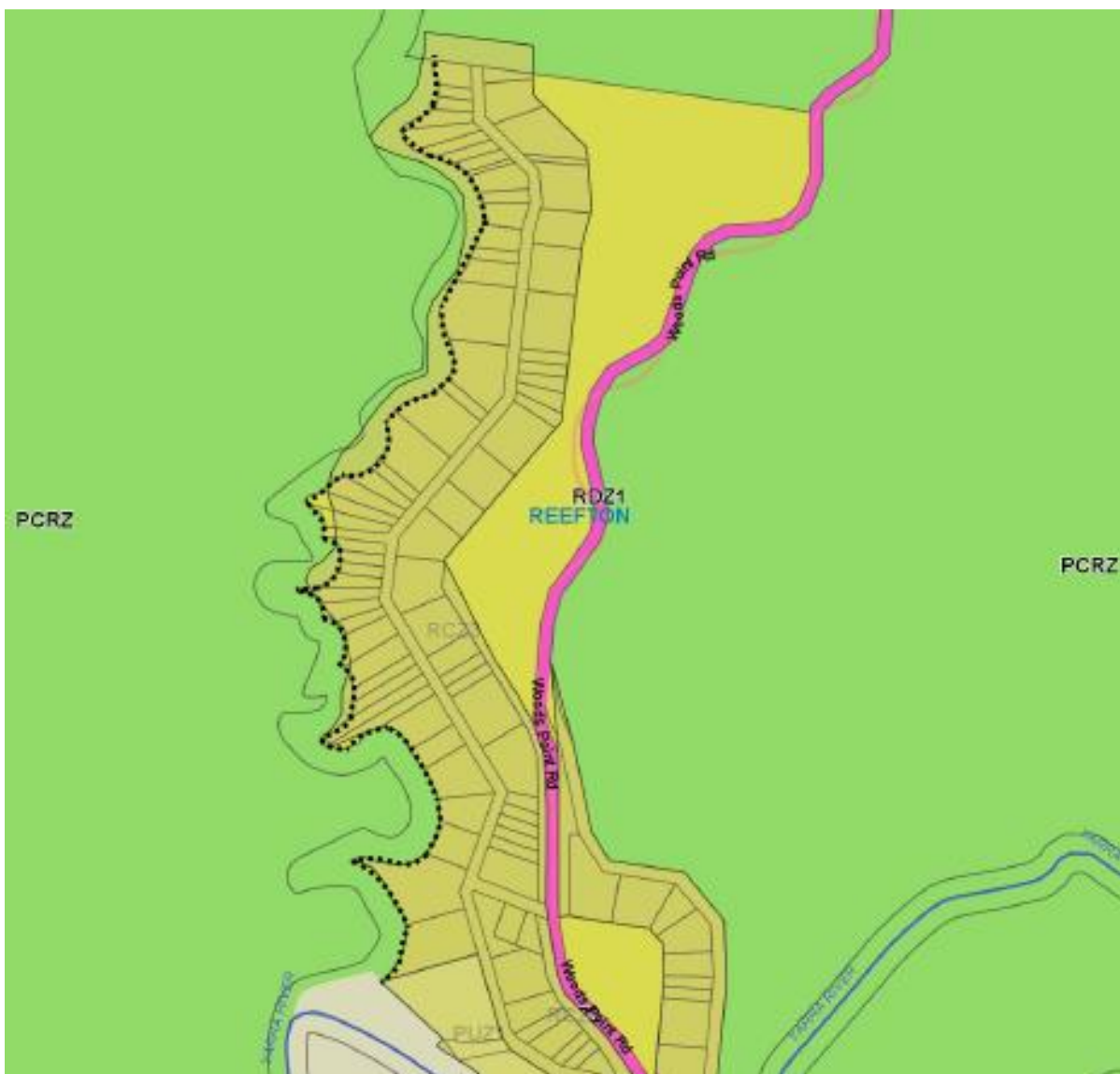
Figure 1: Boundary between private properties and the Yarra River shown by black dotted line.

It is proposed to correct the inaccuracies by mapping the Restructure Overlay in alignment with title boundaries. There is no purpose in the Restructure Overlay applying to areas of the Yarra River zoned Public Conservation and Resource Zone.